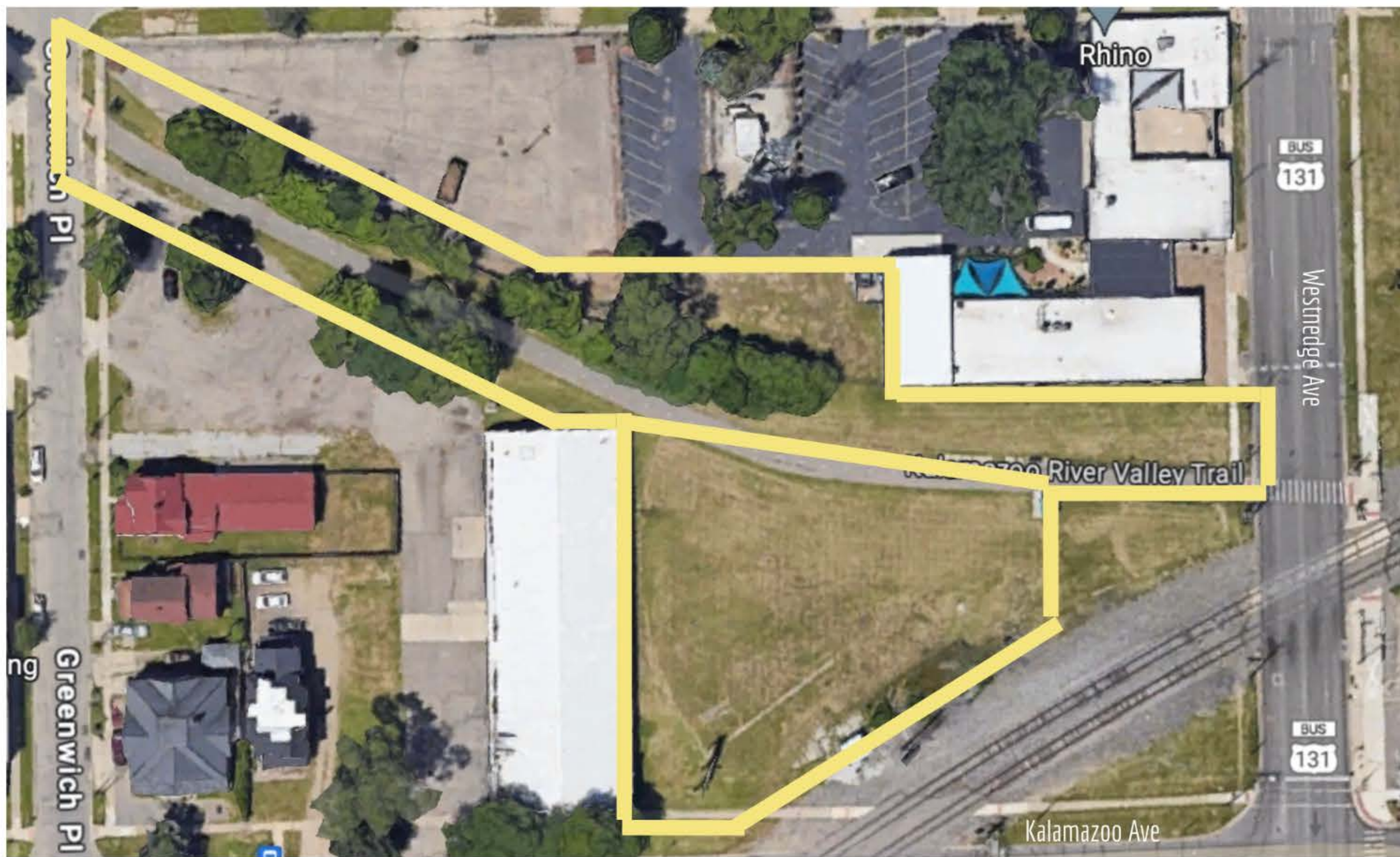
Northwest corner of Kalamazoo and Westnedge Ave

KRVT PLACEMAKING DESIGN WORKSHOP FOR RESIDENTS